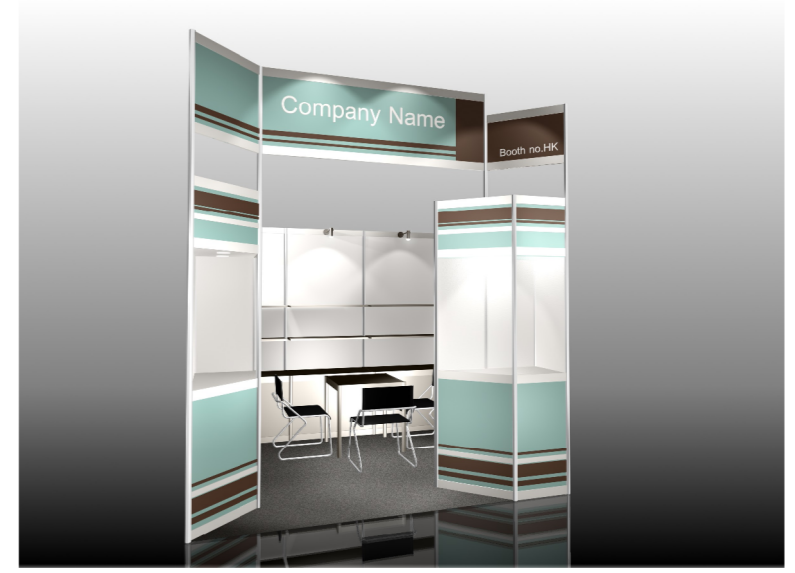
COLOUR PERSPECTIVE N.T.S